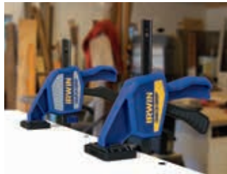
Wider Clamping Pressure